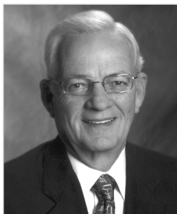
Secretary Paul O'Neill